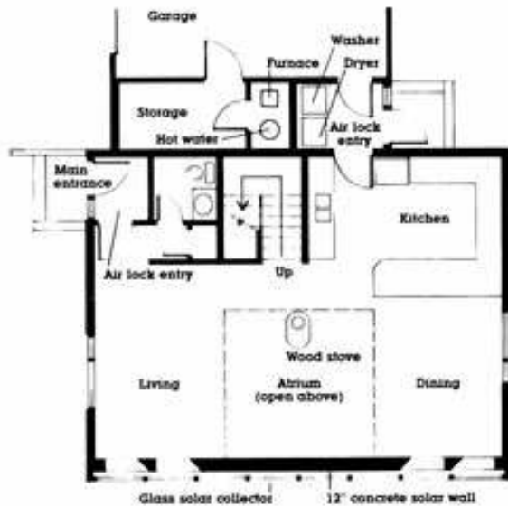
Starboard Solar Home

The floor plan features a high atrium centrally located for natural lighting. Second floor bedrooms are separated by the atrium space. A connecting balcony overlooks the downstairs. A greenhouse is optional off dining room. Garage buffers the north side.